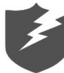
Cyber Incident Responder