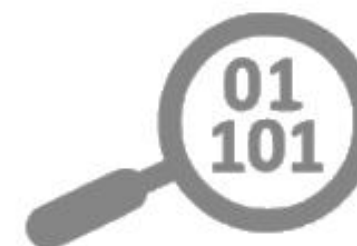
Digital Forensics Investigator