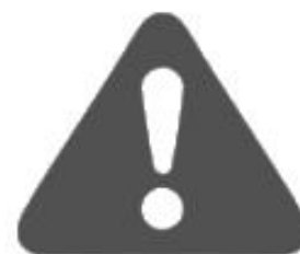
Cybersecurity Risk Manager