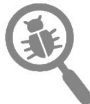
Cyber Threat Intelligence Specialist